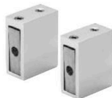
Track Holders (wall)