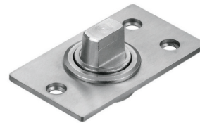
Bottom - Pivot Patch Fitting - Bearing Pivot Pin