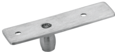
Top Hardware - Pivot Patch Fitting - Pin