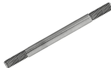
Solid Canopy Rod - Pre-Threaded (10mm dia., 1524mm length)